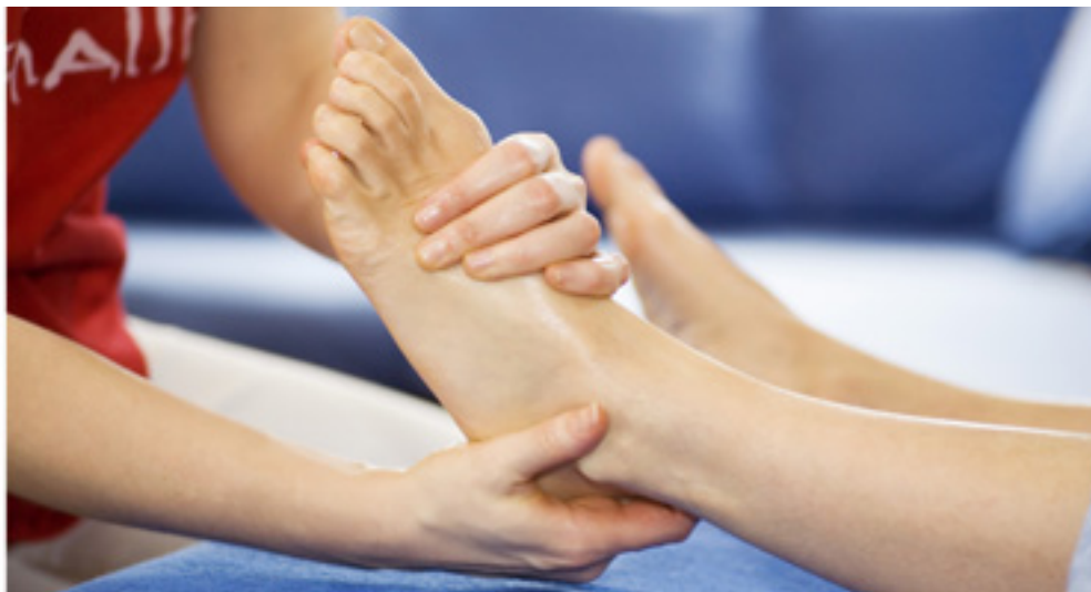
The foot has a greater quantity of sensitive nerve endings than other body parts.

Although simplistic in application, the effects of the treatment can be profound. Through activation of nerve receptors in the hands and feet, new messages flood into the body system, changing its tempo and tone. In essence, the foot or hand becomes a conduit for sharing information throughout the